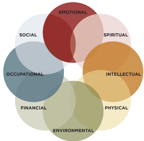
EIGHT DIMENSIONS OF WELLNESS*

We also recognize that we live in a multicultural world, and wellness encompasses areas that may not be specified in this brief discussion. We believe, for example, that trauma is a universal human experience, and that our culture and spiritual beliefs impact our perceptions and everything we do. In summary, wellness is about how we live our lives and the joy and fulfillment and health we experience.